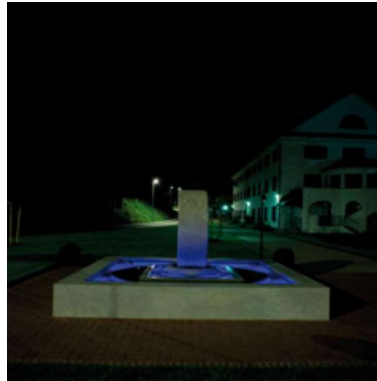
Gieseke und Devrient DE - Gmund